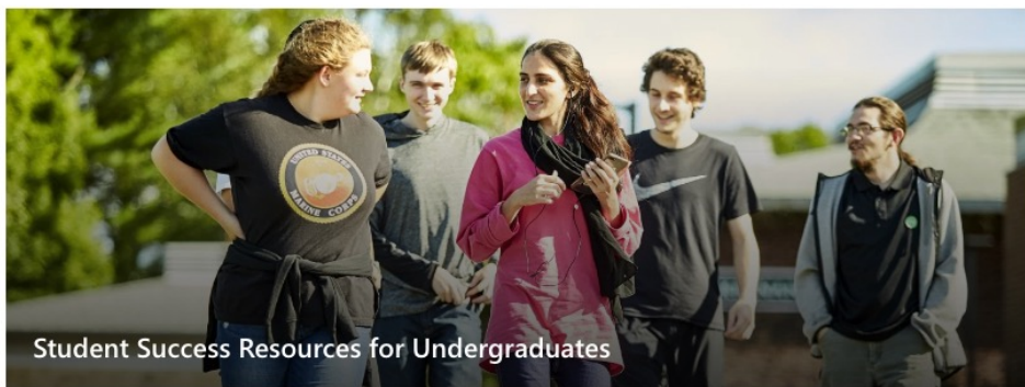
Student Success Resources for Undergraduates

When you are at this web page , you can scroll down and there is a tile for each functional area: